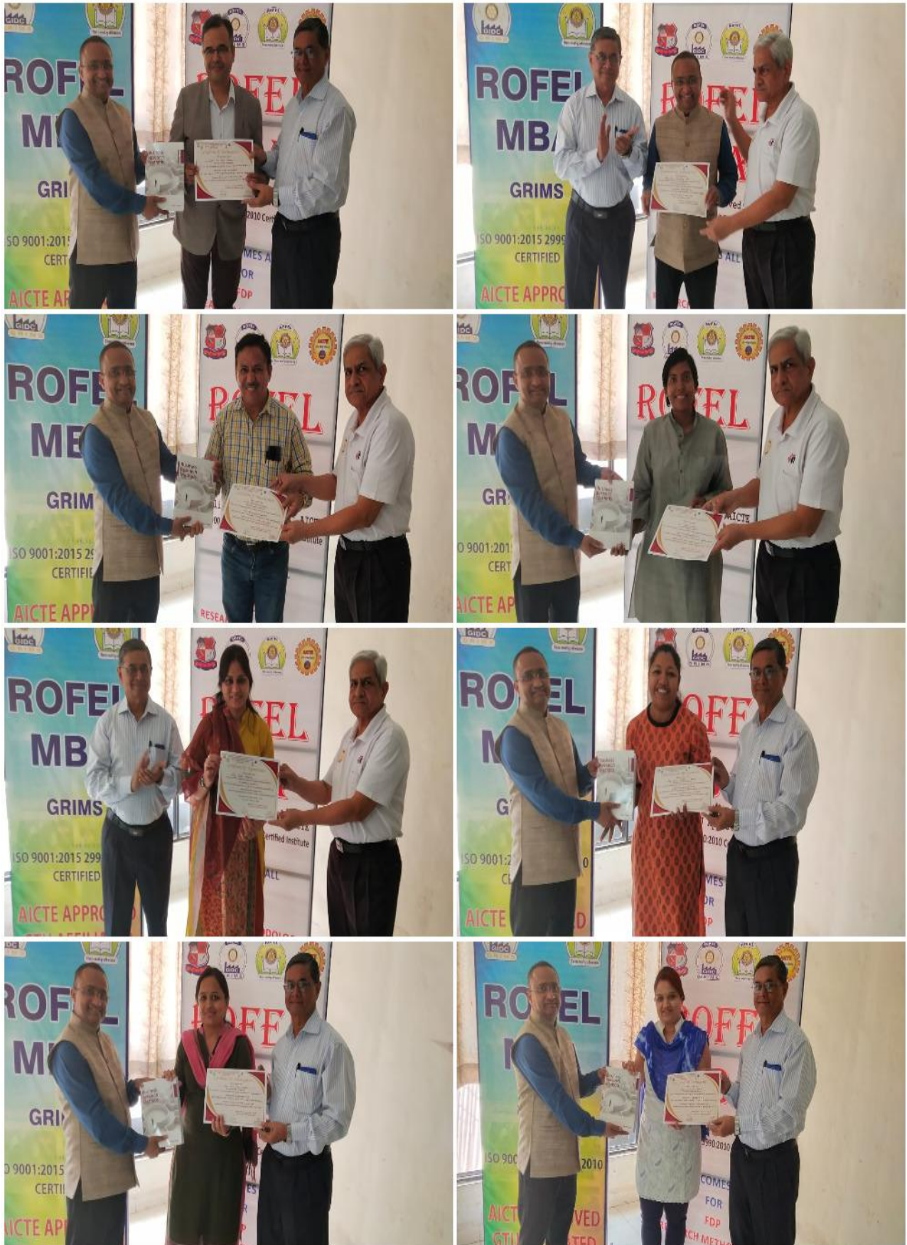
GIDC Rajju Shroff ROFEL Institute of Management Studies, Vapi.