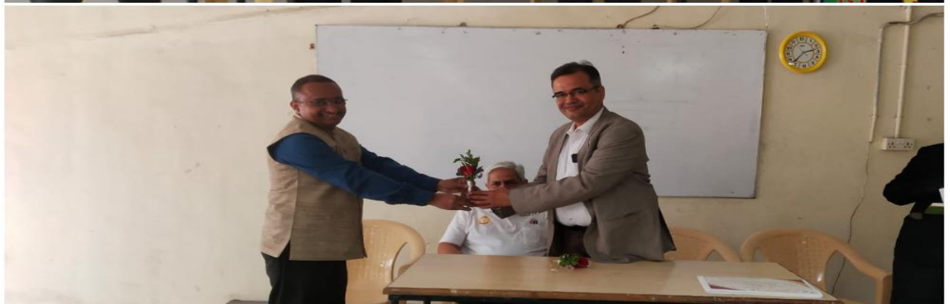
GIDC Rajju Shroff ROFEL Institute of Management Studies, Vapi.